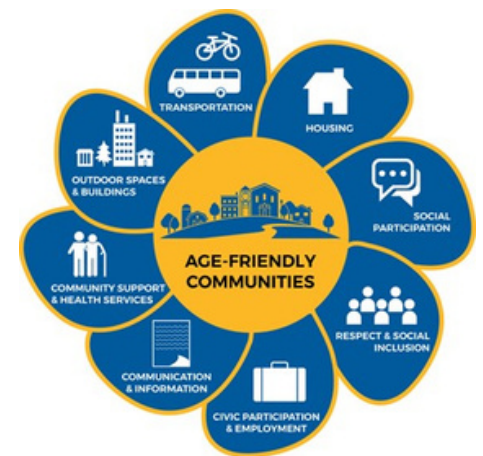
WHO Age Friendly Domains