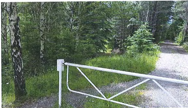
Pawsons Road gate to move – old road on left