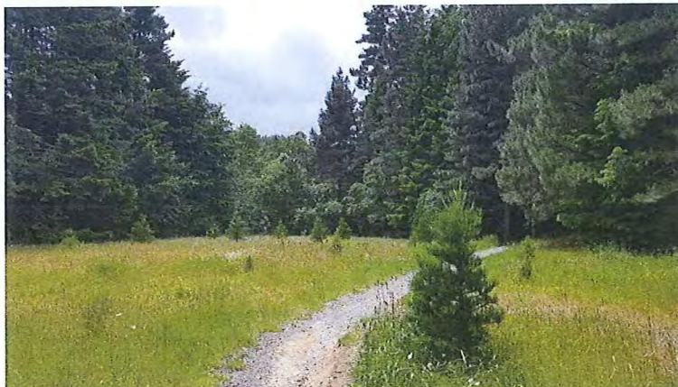
Old camping area

In addition to the above I would charge users to use the facilities in conjunction to an honesty box for staying. Revenue gained could be put towards maintenance, native conservation of the area.