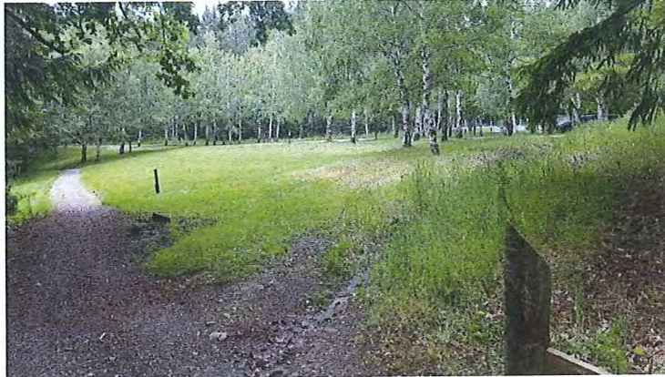
West view of area to raise showing cycle track