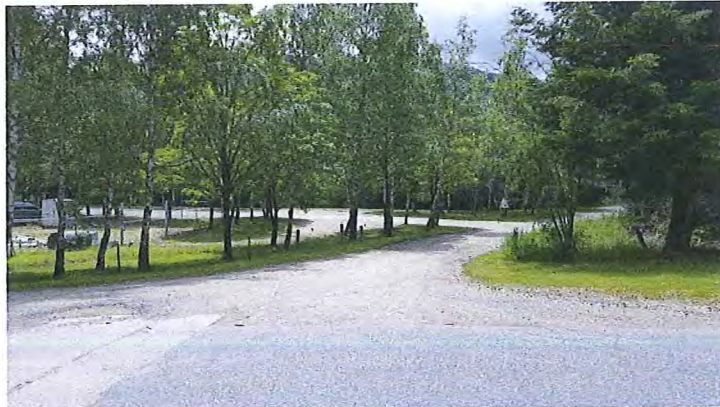
DOC freedom camping site

To me this is an excellent location, it is within walking distance to the village and the walks and it offers safety.