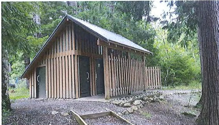
Existing toilet block which is not coping with the numbers

If external funding was found the site could be taken over and maintained by the Hurunui District Council utilising as stated above fees from the toilet block/s, donations etc.