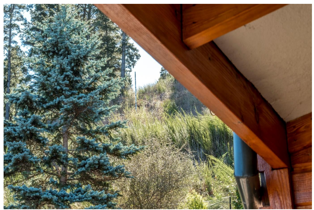
Photograph 3 – End station as viewed from 24 Oregon Heights