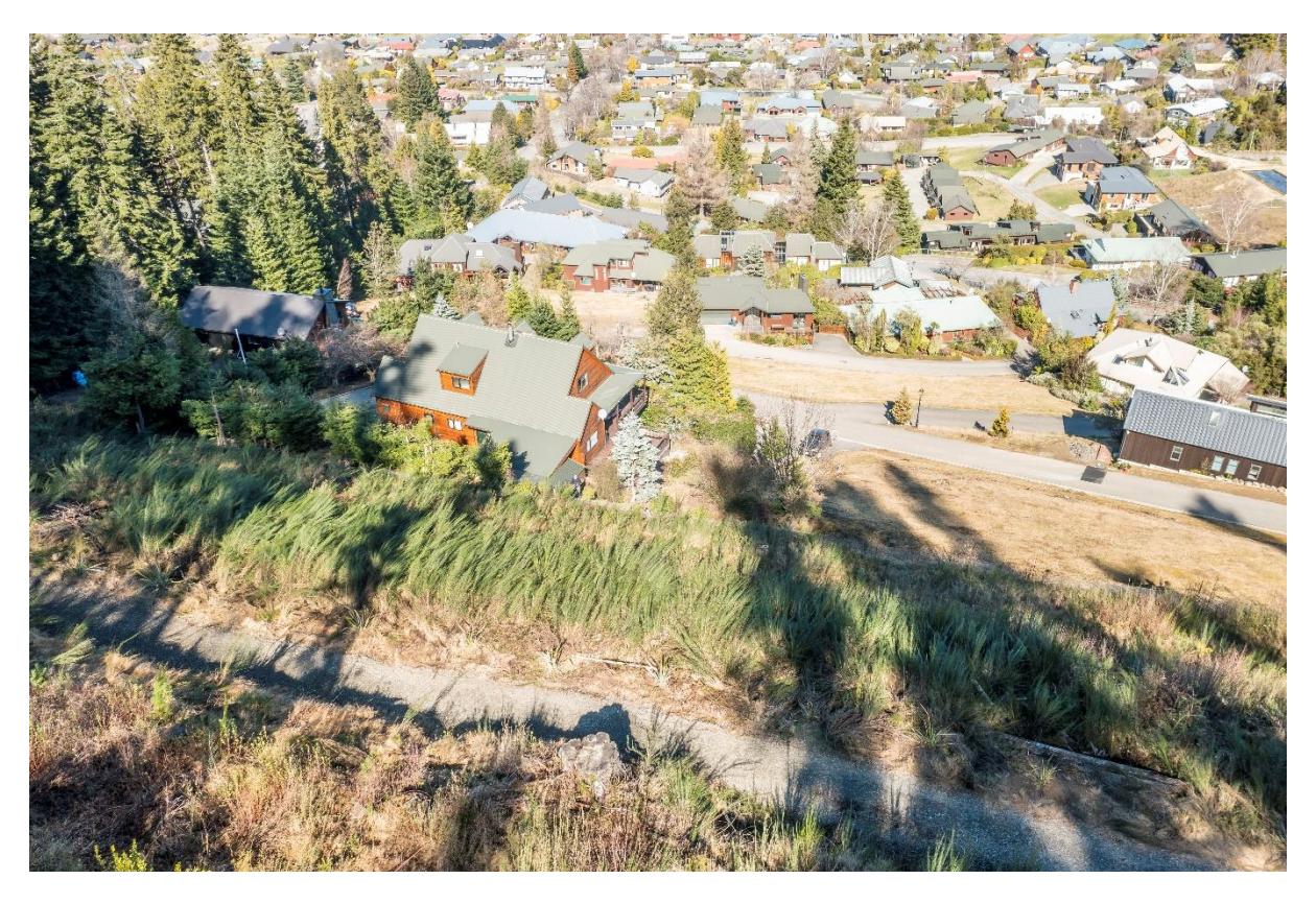
Photograph 1 – End station location above 24 Oregon Heights